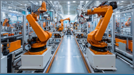
AUTOMATION & INSTRUMENTATION