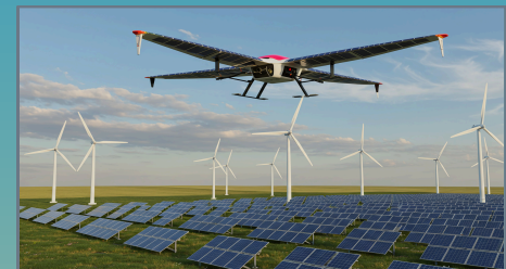
POWER & RENEWABLE ENERGY