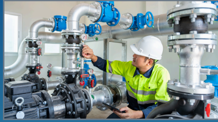
PUMPS , VALVES & SEALS