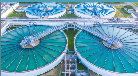
WATER TREATMENT & FILTRATION EQUIPMENTS