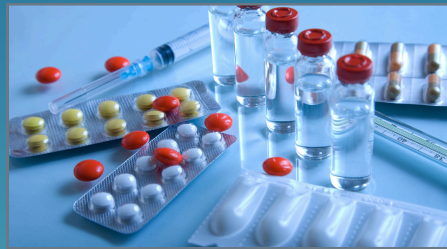
PHARMACEUTICAL & LAB EQUIPMENTS