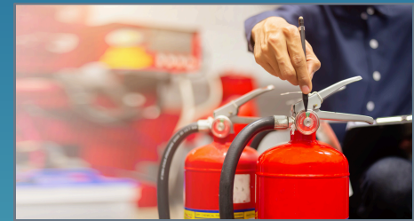
FIRE SAFETY & SECURITY EQUIPMENTS