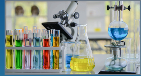
CHEMICALS, POLYMERS & PETROCHEMICAL