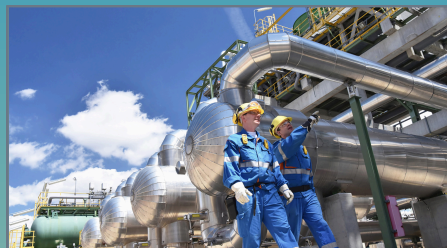
MACHINERY & METALLURGICAL INDUSTRY